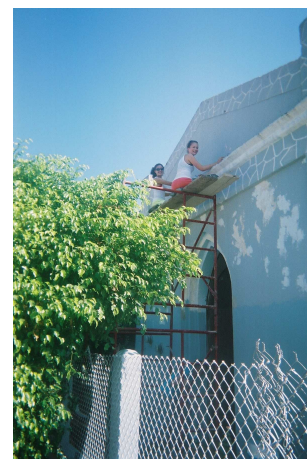
Service is a higher calling, as the 2006 mission group found

Join with others from across the U. S. in a ten-day immersion experience and service trip in Mexico. Participants will