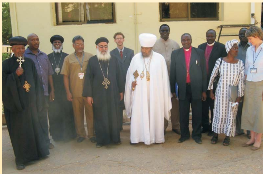
The ecumenical delegation together with Church leaders from Sudan.

In August 2009, AACC attended the General Assembly of the Sudan Council of Churches (SCC) where the SCC issued a strong call to the global ecumenical family summarized in the words: “Let Us Join Together to Rescue the Peace for Our People”. The situation in the Sudan is once again very tense, with severe problems with the implementation of the Comprehensive Peace Agreement (CPA) between the North and the South of Sudan, with violence and insecurity in many parts of the country and a lot of frustration about lack of development. As a response to this call, the AACC spearheaded an Ecumenical High-level Peace Mission to Khartoum on 3 rd -6 th of