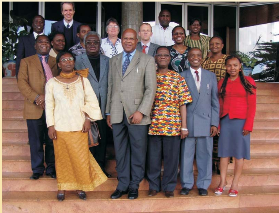
Members of the Theology, Ecumenical and Interfaith relations advisory committee.

The mandate of the Advisory Committee is to advise the AACC and other Christian organizations and institutions on the best ways: