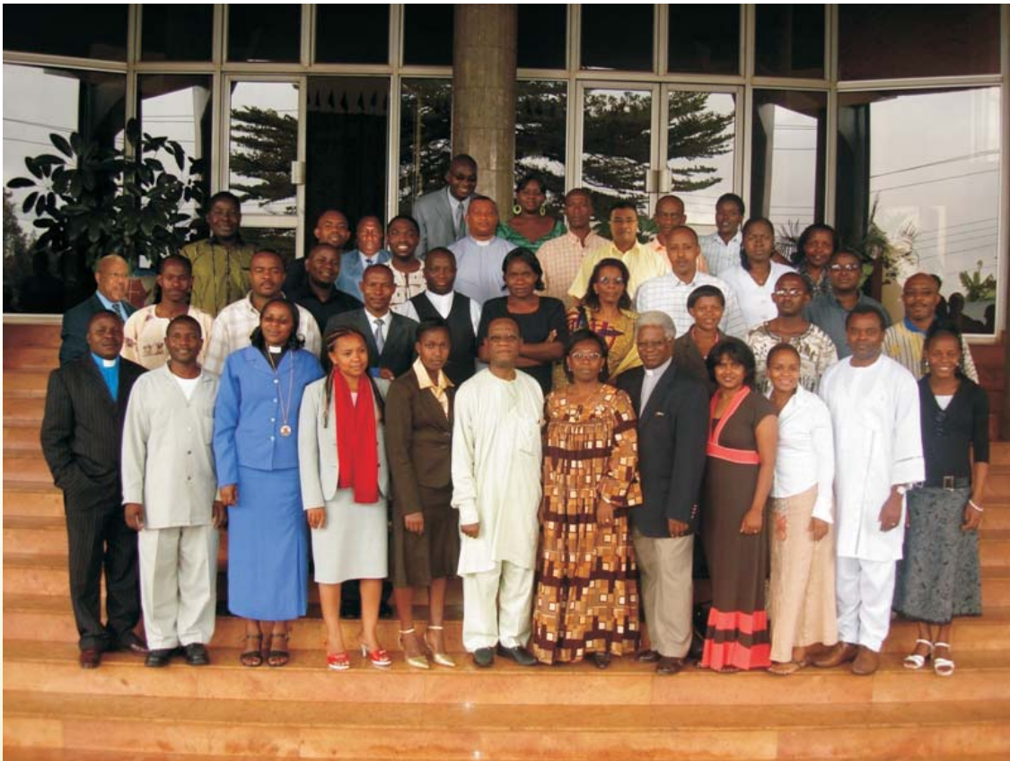
The young theologians who attended the AACC second Theological Institute together with their facilitators.

T he AACC Second Theological Institute met in Nairobi from 29 th November to 5 th December 2009. Thirty-three young theologians from different parts of Africa and seven facilitators interacted on “ The Crisis of Stewardship in Resource Management: A Theological Answer from Africa. ”