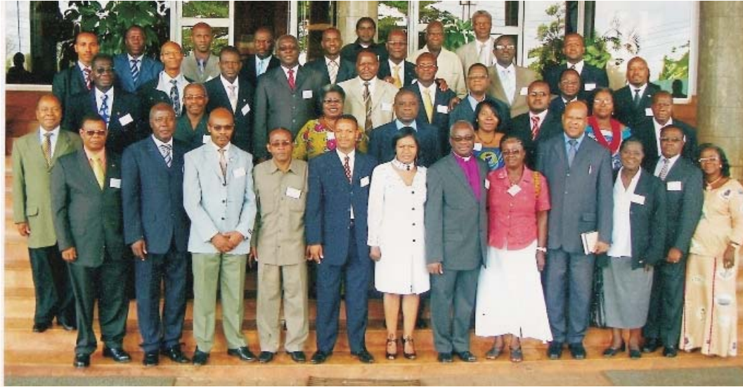
Church lay leaders who participated in the capacity building workshop together with some of the AACC staff.