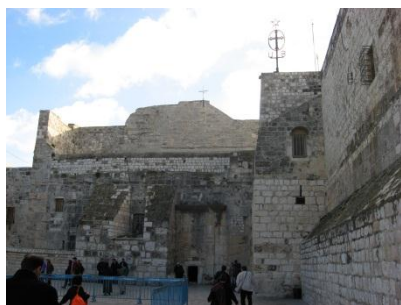
Church of the Nativity