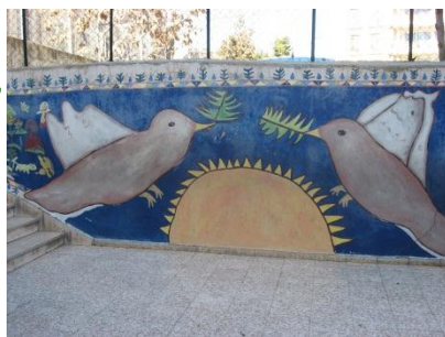
Rawdat el-Zuhur (Garden of Flowers), a primary School for Palestinian children in East Jerusalem

Old City, Via de la Rosa, Mt. of Olives Justice tour of Jerusalem, Sabeel, B'Tselem, Rabbis for Human Rights, Settlements