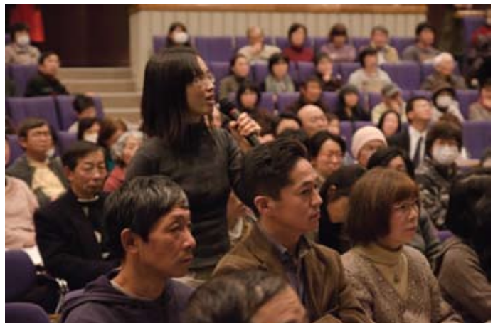
A concerned citizen raises a question at an ARI-organized radiation lecture for the local Nasu community.