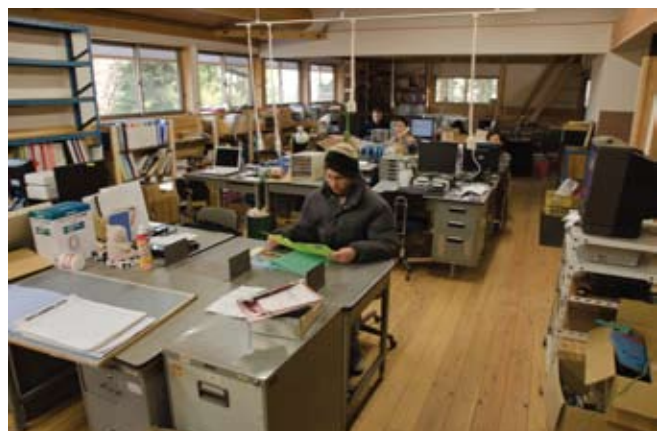
... into the second floor of the new farm shop. Carpenters along with volunteers joined in to create a practical work environment.