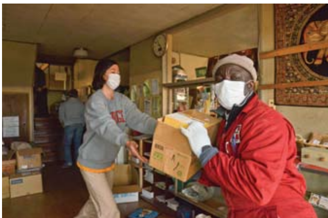
December: Every hand is needed to move the offices out from the damaged main building...

The last area that needs attention is the farm. The concrete pigpen, which is connected with our biogas system, was