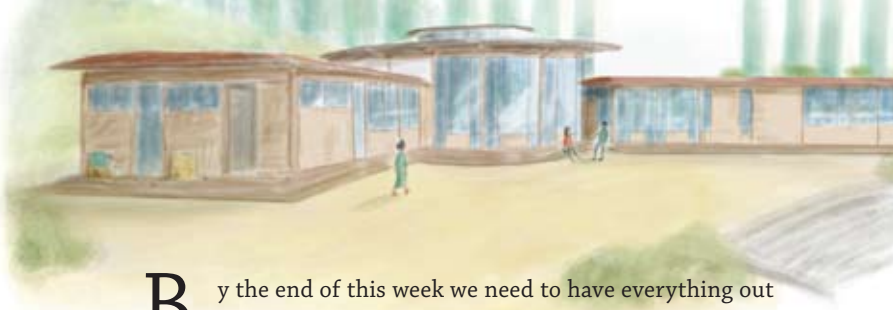
Sketch of the new Koinonia and classroom buildings

By the end of this week we need to have everything out of the main building. By the end of the month, there will no longer be a main building. Such is the radical transformation now taking place. Unstable buildings like the main building and the Koinonia Dining Hall need to come down; others need to be repaired. Work has been going on throughout this year and will continue well into next year. Some facilities will be completed and ready for use by the start of the next training program in April but others will still be under construction.