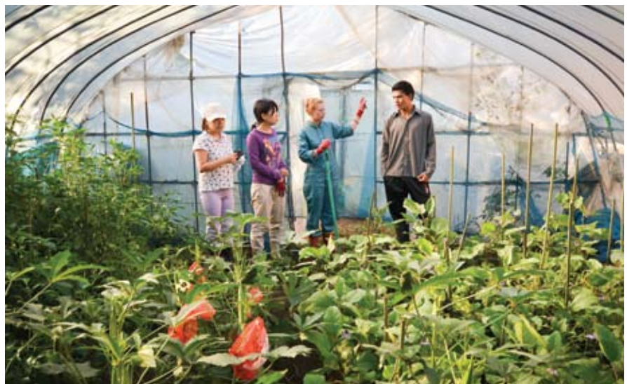
To avoid contamination from air and rain, vegetables were grown inside greenhouses.

One of the most stressful aspects of living with radiation is wondering how safe your food is. In the case of my own experience, the first time I watched my daughter drink a glass of cold water outside of ARI, I was petrified – though I was probably overreacting. Meat and produce in the supermarket, kids' school lunches, and that glass of water at the restaurant need to pass through a system of government checks. And it looks like the government efforts to conduct these tests are being done in earnest. The problem is that even in earnestness, mistakes can be made (and when they are they hit the headlines) and also the government standard for permissible radiation content is high – 500 Bq/kg for food and 200 Bq/kg for water and milk. Since ARI's food comes from our own land we decided to set our own limit – 37 Bq/kg. This is the standard for food for