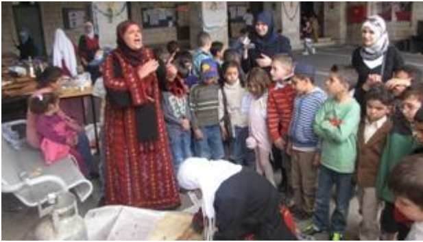
St. John's School-Haifa

September 5, 2011- Summer is over and here we are again, starting and welcoming a new academic year, bringing energy of new beginnings, and challenges. Hopes blow like a variable wind through our communities as much as any other. With a joyful atmosphere the 1 st graders and the new students coming from all different Arabic towns and villages from surrounding Haifa's were especially welcomed.