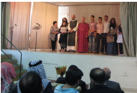
Holy Land Institute for the Deaf

He paid tribute to the dedicated parents, school administrators, teachers and staff. He noted that the diocese continues to excel in providing special education institutions for the schooling of those who are sight or hearing impaired, or have other disabilities. The diocese also provides technical training for vocational opportunities.