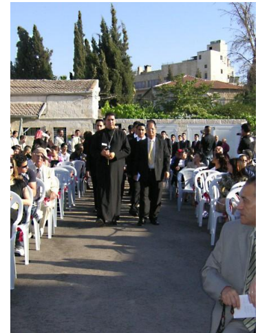
St. George’s School, Jerusalem

“We have sought to continue our tradition in education by holding to that which is true, and reaching out to that which enlightens our minds and captures our imagination in these days of instant internet information,” said the Bishop, who serves as Chairman of each School Board.