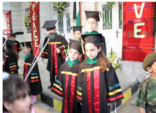
Episcopal Evangelical School, Jordan mainstreaming sight impaired children

The Bishop noted that many students today face “increased hardships stemming from the global economic downturn, worsened by unresolved long standing political issues, especially among the Palestinians.”