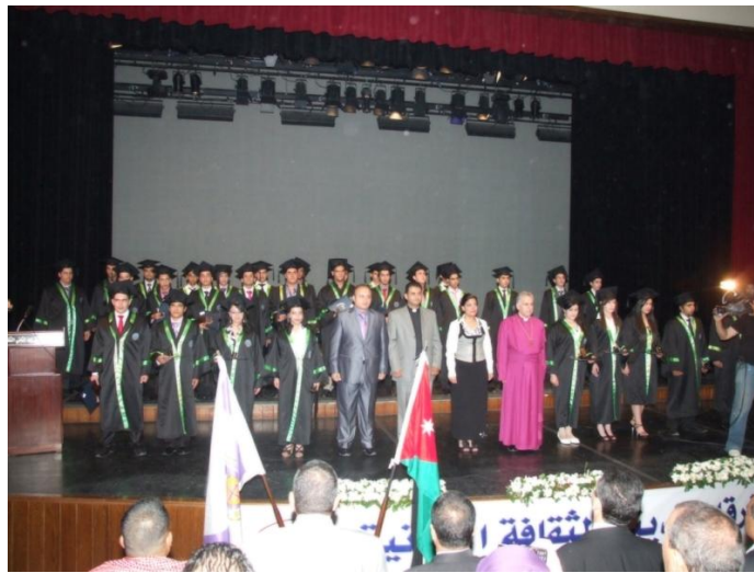
Saviour School, Zarka - Graduation