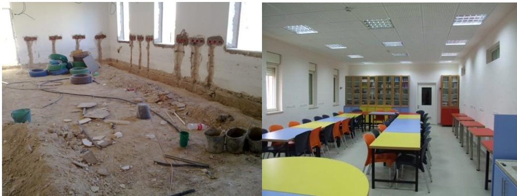
The Elementary School CTDC science lab: Before & After

Elementary school renovations began early in 2010. Upstairs the new Creative Thinking Development Centre (CTDC) has almost reached completion. The renovations required knocking out most of the rest of the second floor for an updated computer lab, a new art and music room, and science lab. Brightly coloured tables and chairs fill the lab room with plenty of equipment for storage and display. A new smartboard is already installed along with the latest in lab safety with full emergency washing facilities in the classroom.