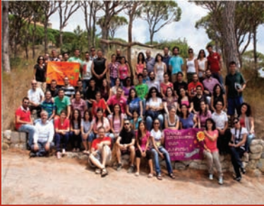
Youth Camp 2011

We thank God for the opportunity to organize our 2011 youth camp, for the 2nd time in a row, in KCHAG. The leader of the camp