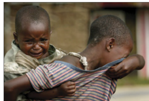
Children fleeing the Congo Photo used with permission

OGHS increasingly supports people and communities devastated by conflict and violence and are committed to work toward ending genocide and violence.