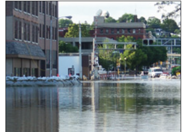
2006 Midwest flooding Photo used with permission

Gifts to One Great Hour of Sharing assist many individuals, families, and communities across the US and around the world to rebuild their lives after disasters. UCC/OGHS responds to disaster on the average of once every 2.5 days.