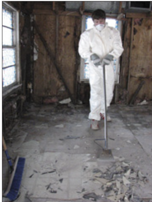
Jeff Galasyn cleaning during mission trip to New Orleans Photo used with permission

You are part of this multi-layered story. You are personally involved in disaster recovery through your gifts to OGHS . Your treasure puts into motion these heart-wrapped connections that make God's love real in the world.