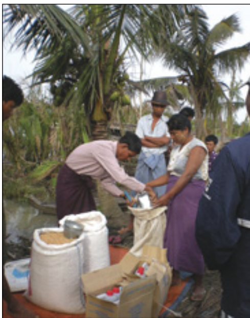
Aid distribution

ACT members continue to be active in the huge rehabilitation efforts required to support the people of Myanmar. Plans for 2009 include construction of permanent housing, schools and community cyclone shelters, agricultural livelihood recovery, and improved access to potable water. Once again, the church stays for the long haul of recovery.