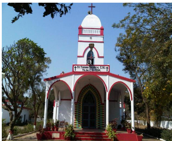
Evangelical Church of North India