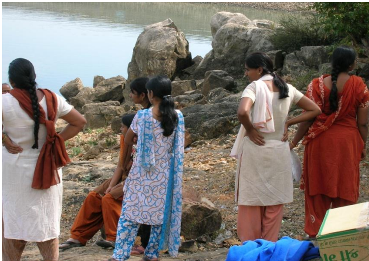
Women gathered by the River