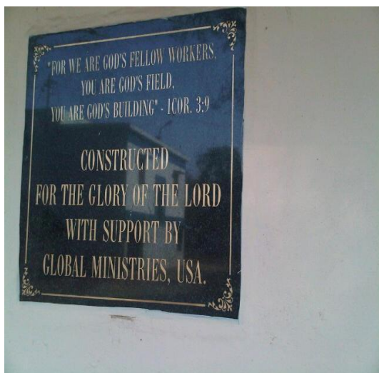
Plaque for honoring Global Ministries' USA support of the new nursing school student dormitory built