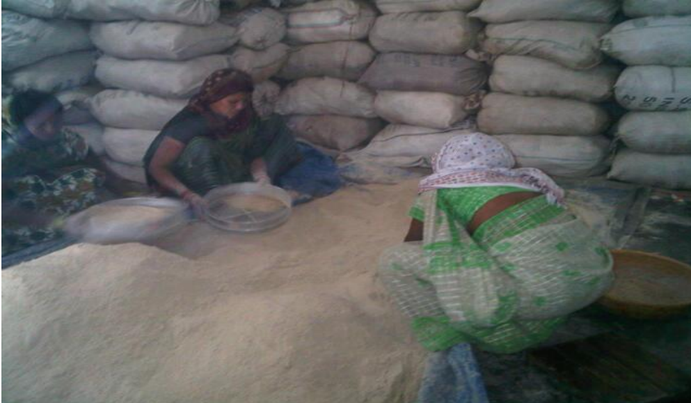
Women making the ready mix food at the Khadi Gramodyog Bhavan Center

On our second day in Tilda we had an amazing experience when we had an opportunity to explore the surrounding community. We visited the small surrounding “Khadi” Village, a Community Development Cooperative, modeled after the message and philosophy of Gandhi. Khadi cotton is one of the village’s primary market productions which, is a prime sustainable resource for the center, oil, printing and the production of ready mix sustainable food for the mal-nourished and school children are also among the center’s products. This is a glimpse of Social Justice in action.