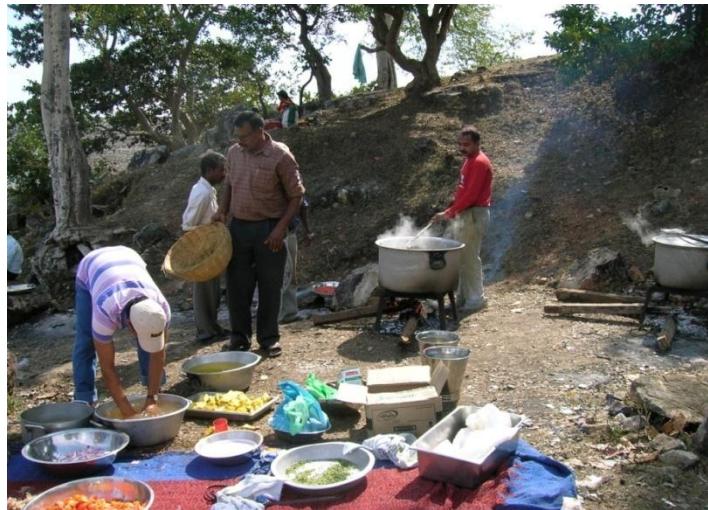
Mungeli Men preparing the picnic meal

The picnic just as last year was truly one of the many highlights of the journey. There is nothing more moving than the sights and sounds that consumed my soul as I looked out over the vastness of the river dam while the sun kissed our skin as we women sat on the blanketed ground chopping vegetables, peeling potatoes and cleaning rice in preparation for the men who were in charge of the cooking, while we were looking on and waiting for them to work their miracle in creating the most delightful meal ever. I watched the children and many adults take to their life jackets and with pure excitement and some fear mount the water rafts as they set out for an adventure to journey out onto the river. I witnessed the brave and beautiful ones who shivered on the rocks from their water chilled bodies that had been immersed in the river like a new baptism as they took lessons on how to swim. Later we all gathered around in a circle, singing songs of joy and thanksgiving as we prepared for our meal together. I offered a prayer of blessings and reflection on God's goodness and provisions.