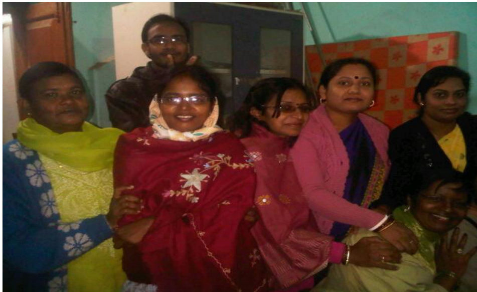
Teachers, Rambo English School during a workshop session

At the Rambo English School, the curriculum was reduced to five sessions and modified to address the particular contextual needs for the teachers as providers of education and care for the whole person/student.