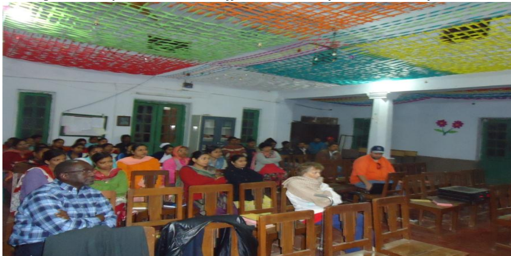
Staff, Christian Hospital Mungeli during a workshop session

The hospital staff showed out in great numbers full of thoughts and curiosity, eager to hear more on how to make the most of what they do best in caring for others. Each evening the Chapel was transformed into a classroom, with video sessions and small group discussions where we shared our ideas and understandings of being the beloved community of care for the whole person. We had fun with some competition and group participation incentives such as popcorn and American chocolates....Yum! All in all, the group worked hard to develop their own understandings of multidisciplinary care in their context to help them create a working document for a mission statement.