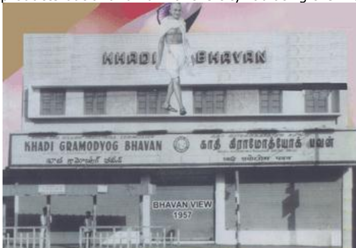
One of many Khadi Gramodyog Bhavan Centers in India

Khadi Gramodyog Bhavan is not a mere marketing outlet for Khadi and Village Industries products but a landmark of the city radiating the message of Mahatma Gandhi .