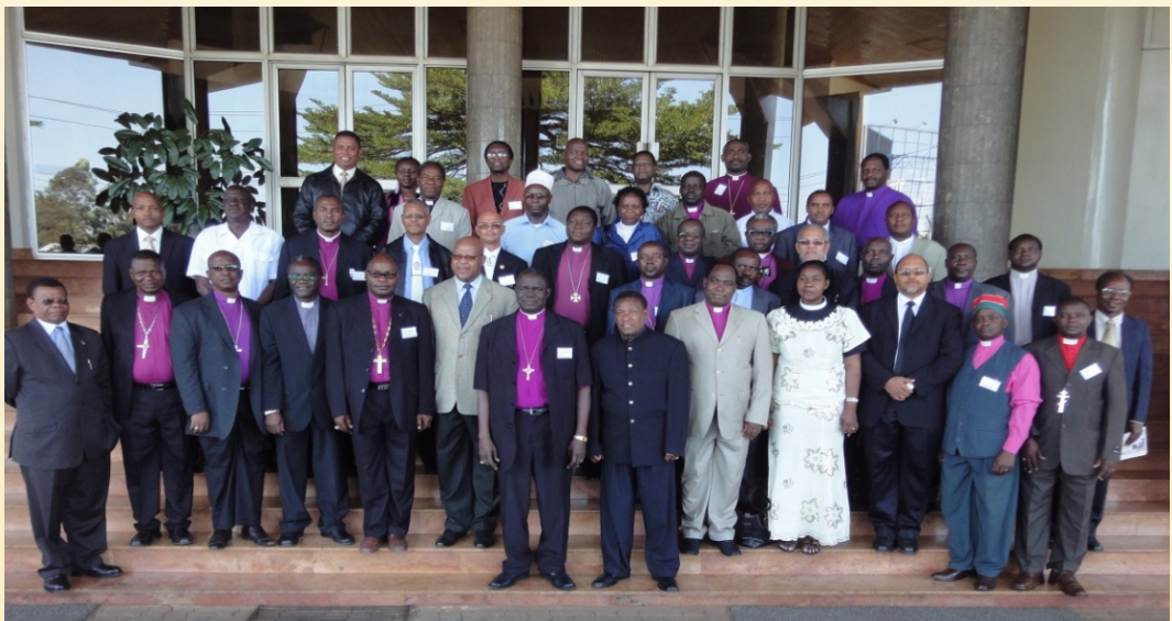
Group photo of the course participants

enhanced the church leaders' role in addressing the challenges of church sustainability. They also discussed current trends on