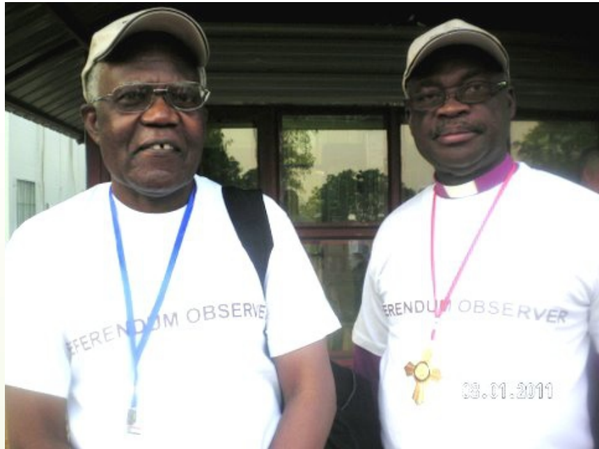
AACC Referendum Observers in Sudan

It is true that incidences of ethnic conflicts began to escalate in the run up to the referendum. But there was evidence to show that such conflicts were as result of incitement. The Sudanese churches, with the support of the ecumenical community, took the need to address the issue of ethnic conflicts and violence very seriously indeed. As a part of “people to people peace initiatives” the churches engaged community leaders in the affected areas. In order to address conflict and violence at all levels the Sudanese churches cooperated with the AU High Level Implementation on Sudan led