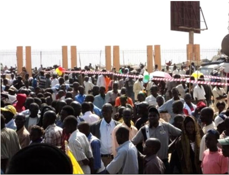
Long queues of voters at John Garang's Mausoleum

rejected the dominance of one identity over other identities which saw them relegated to second class citizens in their own country. For the southern Sudanese, the referendum is a means to reaffirmation of their dignity as a people and a rejection to being classified as sub-human. Africa and the international community has been impressed by the dignified manner in which the people of south Sudan conducted themselves throughout the week long referendum. We were encouraged by their character to demonstrate their sense of civic duty and the general atmosphere of peace, which prevailed. This happened despite the fact that the referendum came