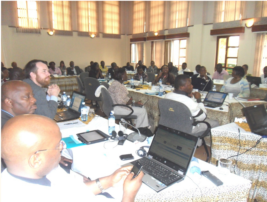
A session during the CSO consultation