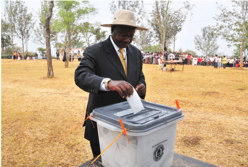
President Yoweri Museveni of Uganda casts his vote during the Presidential elections in Uganda.

A t the invitation of Uganda Joint Christian Council (UJCC) the AACC sent an observer team to the just concluded presidential elections on the 18 th of February 2011.