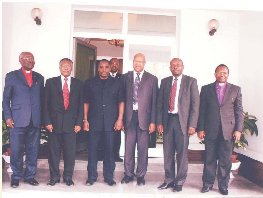
The Ecumenical delegation after a meeting with H.E President Joseph Kabila of DRC.

The All Africa conference of Churches (AACC) and the World Council of Churches (WCC) organized a joint ecumenical solidarity visit to the Democratic Republic of Congo (DRC) from 8 th to 15 th July 2009. The solidarity visit constituted three teams one of which visited Eastern Congo precisely, Goma and Bukavu; the second team visited Bas-Congo and Kasai regions while the third team visited Nkamba - the coordinating center of the Kimbaguist Church.