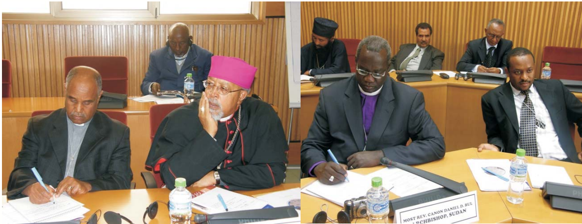
Religious leaders in the Addis Ababa meeting