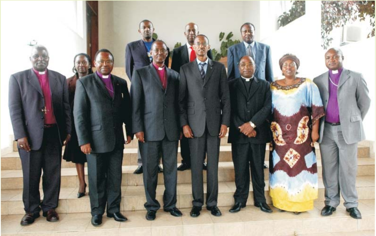
H.E. President Paul Kagame of Rwanda after a meeting with Church Leaders from DRC, Burundi and Rwanda.