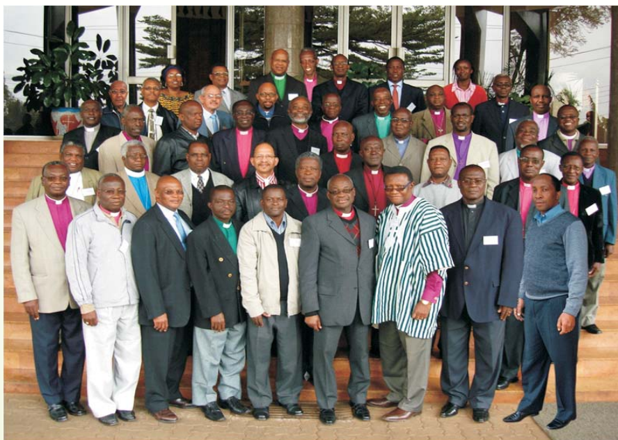
Participants of the orientation course for newly elected heads of Churches

“Thank you for the message. We, as African Churches, welcome this new initiative of offering such a good training to new Church leaders. We have to confess that most of us who have been serving for so long have had difficulties