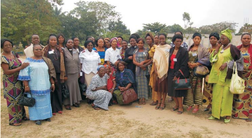
Participants to the Kinshasa Consultation