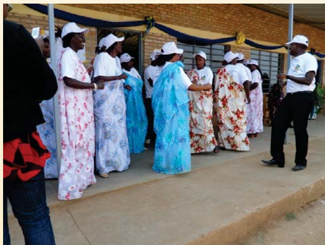
Pomp and dance on the election day in Rwanda

The team concluded that the elections were peaceful and reflected the will of the people of Rwanda ■