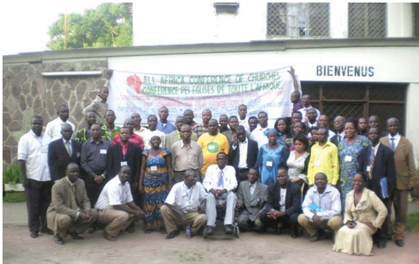
Participants at the CSO consultation held at the Methodist Guest House in Kinshasa, 17-18 May, 2010.

It was within such a background that the All Africa Conference of Churches (AACC) accepted to be the leading consortium for the Open Forum in Sub-Sahara Africa where it has coordinated consultations in 15 countries including Benin, Cameroon, Democratic Republic of Congo, Kenya, Mali, Mozambique, Niger, Nigeria, Senegal, Zambia, Uganda, Ghana, Rwanda, Angola and South Africa. Indeed, the Open Forum understands that churches are also part of the civil society and they would therefore be in these consultations. It was appreciated that AACC had been interested in issues to do