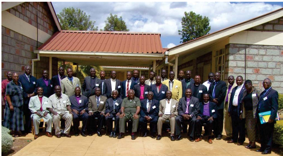
Senior clergy consultative forum.

In their meeting at the AACC Desmond Tutu Conference Center on 27th July 2010, they focused on Kenya's constitutional referendum which was coming up on August 4 th 2010. As it is known