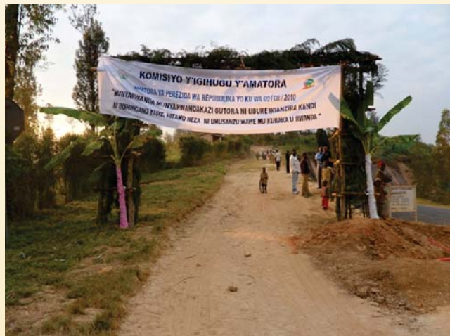
The identity of a polling station.