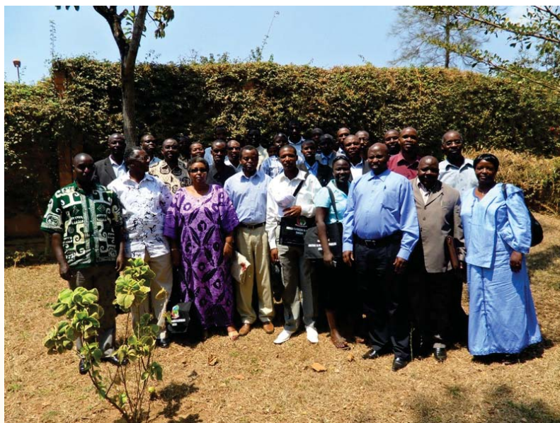
The group of AACC and CPR observers.

These two factors contributed immensely to a sense of ownership in the electoral process and enhanced unity amongst the people of Rwanda. Although the team's mission was limited in terms of time and duration the team indicated that a number of irregularities were noted in the process of polling however the Team considered such irregularities not to be of major impact on the overall results. Arising from the observations the team made a