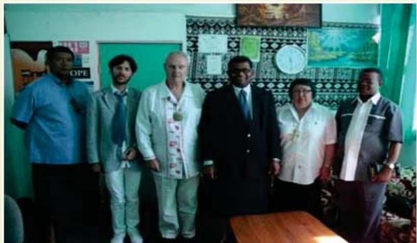
The living letters team