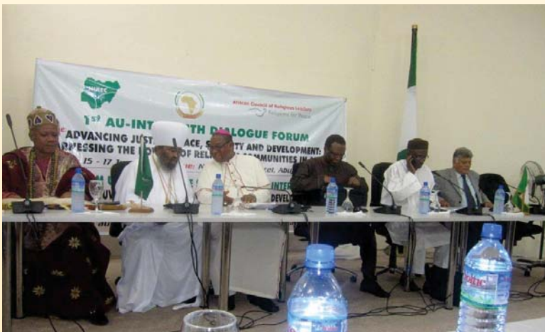
The Interfaith Summit in Abuja, Nigeria

WE identify that the Steering Committee, the Apex Body, for the partnership shall receive technical support from the AUC through the Citizens and Diaspora Directorate