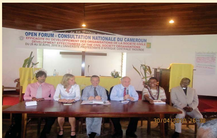
Partners speak at the CSO consultation meeting in Cameroon.

From the onset of the programme, the Open Forum aimed at using country