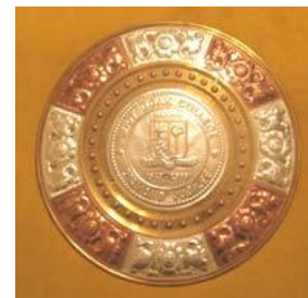
Principal presenting College medallions to retired faculty

Science for Sanitation. The Centre for Environmental Studies organized an environmental awareness parade. Bearing placards, students were joined by Madurai sanitation workers as they marched from the campus through the neighborhood. They then set up tables with information promoting recycling, careful use of pesticides, water conservation and harvesting, etc.