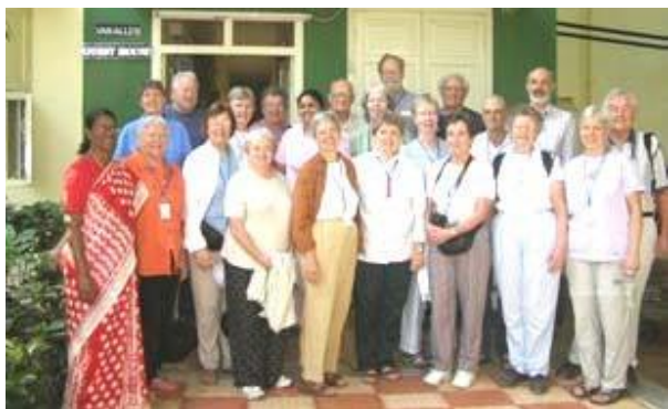
Friends of Lady Doak College at the Van Allen Guest House