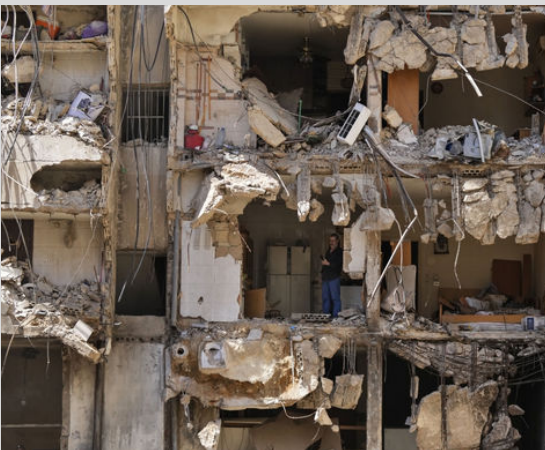
Ammar, H. (2024). man watches rescuers sift through the rubble as they search for people still missing at the site of an Israeli strike in Beirut's southern suburbs, Monday, Sept. 23, 2024. [Photograph]. Colombia Journalism Review via AP Photos.

Most of those rescued are in dire need of medical aid, yet more than 50 hospitals have endured air strikes forcing their closure. Recently, one of the main hospitals in southern Beirut which serves many patients received a warning and hurriedly evacuated the hospital in the middle of the night. However, it was only a trick to bring fear as the target was three buildings adjoining a big government hospital in the same area. The buildings collapsed killing 38 people and injuring many while causing significant damage to the hospital. As the rescue squads rushed to remove people from under the rubble, 2 other adjacent areas in the southern area of Beirut were hit causing the collapse of many more buildings and increasing the death toll.