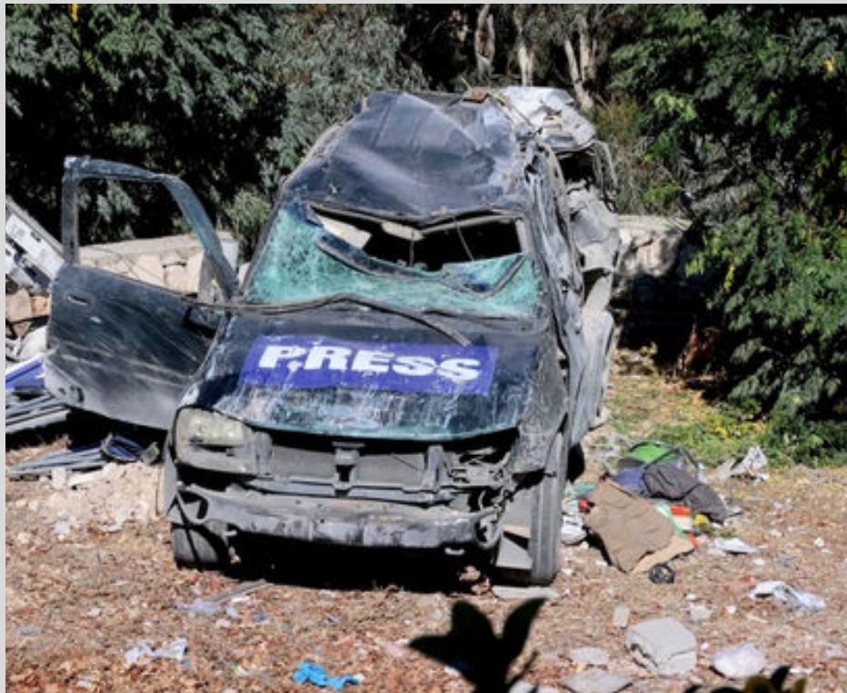
Dallah, R. (2024). A damaged press vehicle is seen at the site of an Israeli strike on a hotel where journalists were staying in Hasbiyya town, Nabatieh, Southern Lebanon, 25 October 2024. [Photograph]. Anadolu via Getty Images. https://rfex.org/lebanese-journalists-confront-risks-and-challenges-amid-israeli-war/

Targeting rescue workers and medical staff is against international law. Yet the Israeli attacks have killed up to date, 107 relief workers. The press has not been spared either, as journalists and photographers are being intentionally targeted and killed. Lately, three journalists were killed and several wounded by an Israeli air strike at night on a group of small chalets where 18 journalists from seven different media outlets were staying while covering the war in Southern Lebanon. Several cars with “Press” signs on them were parked in front of the site.