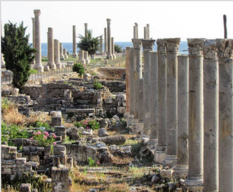
Roman ruins of Tyre.

The ancient city of Tyre with its imposing Roman ruins and hippodromes 83 km south of Beirut. It is a UNESCO-listed heritage city. It was founded in the third millennium B.C. by the Phoenicians who were the first to sail the seas.