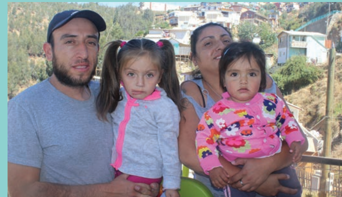
Children gather at the site of the 2014 fire and the Guerra family who were program participants.