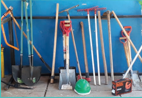
Provided to the community were basic fire emergency management tools (above), community forest fire prevention and management maps and brochures (center) and a 600-gallon water tank (right).