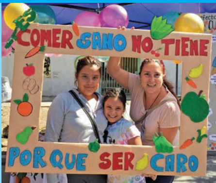
During the community actions, neighbors take a photo with a frame that reads: "Eating healthy does not have to be expensive."